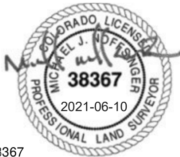
ILLUSTRATION ATTACHED AND MADE A PART HEREOF.